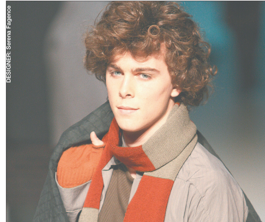
DESIGNER: Serena Fegence