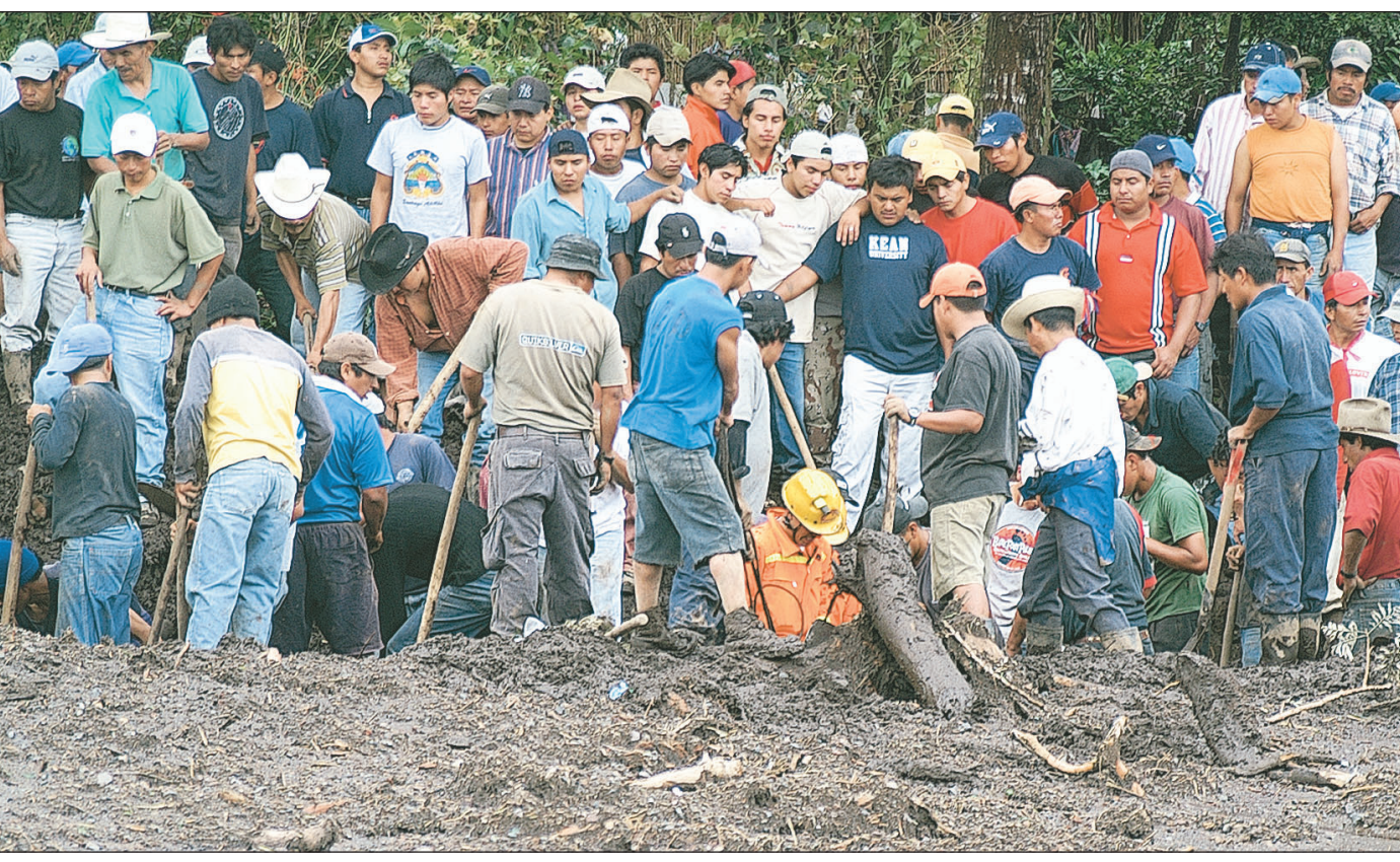
LOOKING FOR SURVIVORS: A crowd of people look on as voluntee

First a boat to Panajachel, then a ride in an army truck as far as it could go, then a walk over an unstable bridge, then a pickup truck from the other side to Anyway we dug and dug until the rain came again the next town and then a bus from there to and everyone had to get off because with more rain Guatemala City. So that is that. Hope you are all well. Send me news.